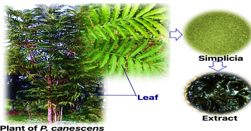
Fig. 1: Plant, simplicia powder, and extract of P. canescens .

Determination is held to ascertain the name and type of plant in a more specific way. P. canescens was determined at the Center for Plant Conservation of the Botanical Gardens of the Indonesian Institute of Sciences, Bogor, West Java, Indonesia. The determination process was conducted in March 2021.